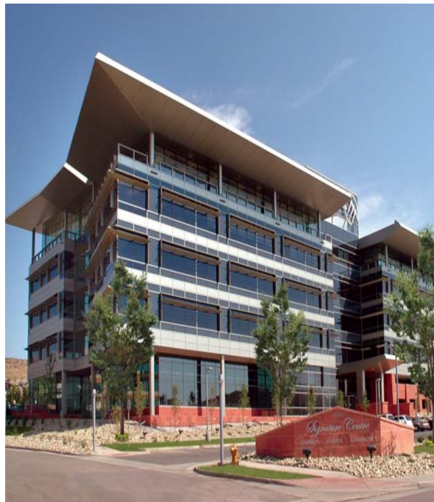
LEED Platinum Certified Signature Center Building- CO